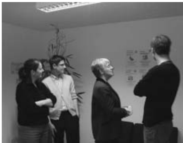
The Moderator visits our office in December