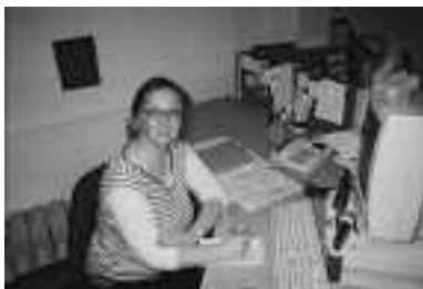
Caroline logs a newly arrived birth certificate