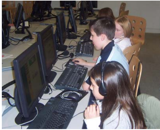
Members of the News Team at work on Issue 1

Each newsletter involves after school sessions where the team are supported in making decisions about the content and design and producing articles. The team meet at the City Learning Centre ICT centre.