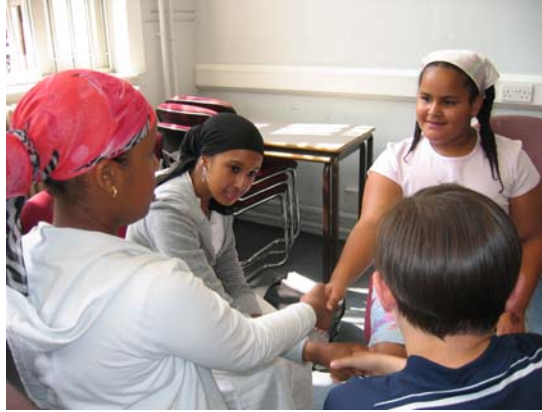
Young Evaluators during training

The Young Evaluators analysed the responses to the questionnaires and, for both Projects, found that nearly everyone was positive about the suitability of their Project activities and about the staff. They also thought that the Projects had helped to improve their lives.